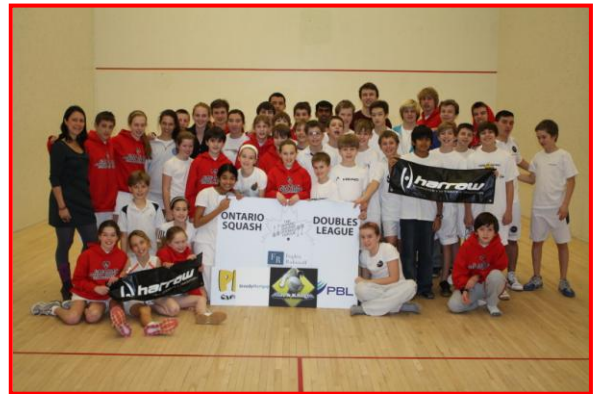
Future of Doubles – looking good!