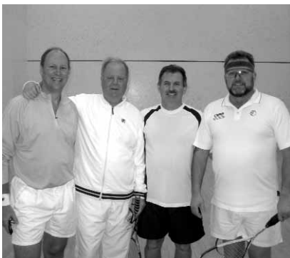
4 tired guys – 100s of lucky juniors.

On a snowy Friday in February, many, many doubles players battled the snow and traffic on the QEW to converge on Cedar Springs Racquet Club to play for junior squash. I would like to acknowledge the incredible efforts of the organizing committee for the Mackay Doubles Tournament – well done! About $15,000 was raised from the silent auction to support junior squash in Ontario. They make us all proud to be Jesters.