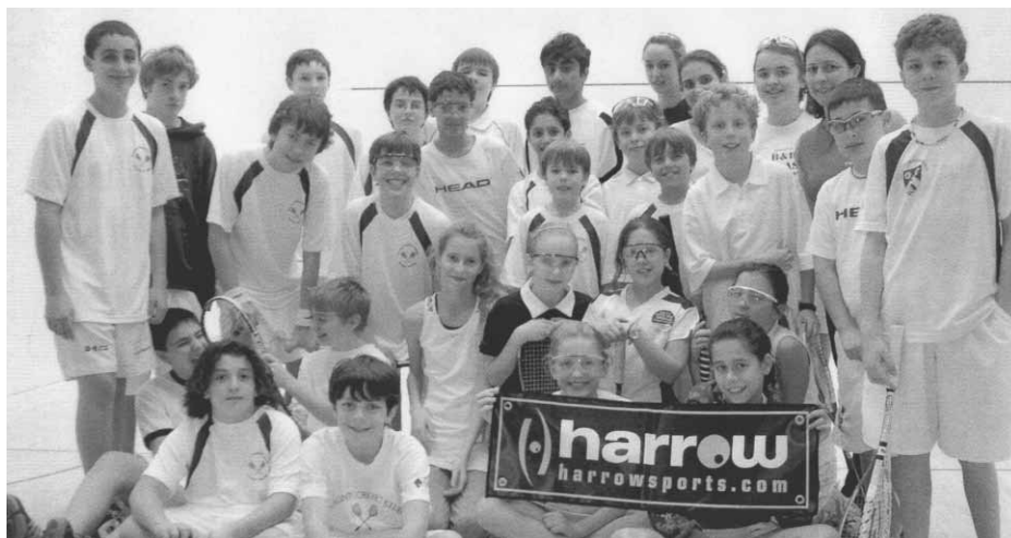
Budding Doubles Players

Until next year, don't forget, junior doubles, DOUBLE THE FUN!!!!