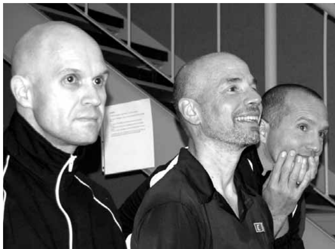
A family affair; photo credit: Jonathan Borland